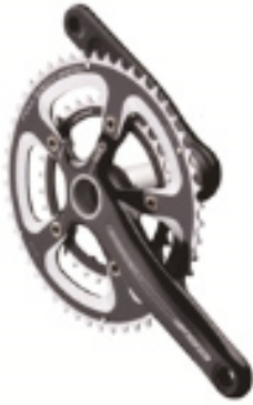
Gossamer BB30 Crankset

Full Speed Ahead (FSA) has received reports that the bolt shoulder on the non-drive Gossamer BB30 series crankarms can crack and break if the installer exceeds the recommended torque specification while tightening the crankbolt. If the bolt shoulder is cracked or damaged in any way, the crank arm can potentially loosen, allowing the rider to lose control and fall.