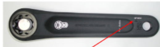
Figure2: Serial Number Location

Gossamer BB30 non-drive crank arms that are subject to recall have serial numbers beginning with 10B, 10C, and 10D, (Figure 1).